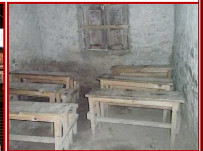
Decay of the school in Lipni