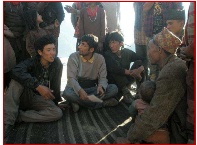
Discussion with a family

search for another source of income, sometimes meaning even more work in the fields so that everyone can get something to eat.