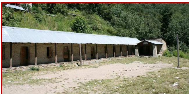
School in Lali

We could also talk to the principals about problems concerning work organization or the management of teachers working for the schools. Indeed, there seem to be major shortcomings in these professionals' training concerning basic teaching but also regular attendance. Contrary to the what we know in France, there is more need to check teachers' absenteeism than pupils'.