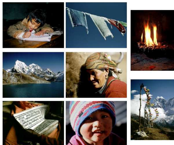
Set of 8 postcards

(8 postcards size 4x6 inches and 8 envelopes: 10€, carriage costs: 0,87€).